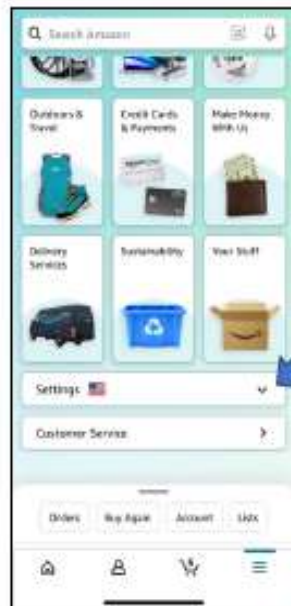
Step 2. Click the drop-down menu on the Settings tab.