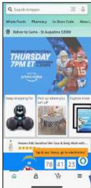
Step 1. Click on the 3 lines in the bottom right corner on the app.

While 0.5% may not seem like much, those Amazon purchases add up! Thanks for your support!