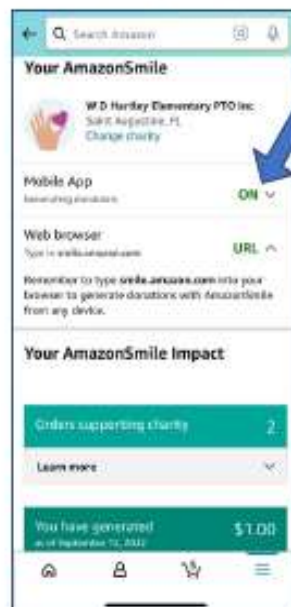
Step 5. Once you have selected the organization, confirm that the Mobile App (generating donations) says ON.