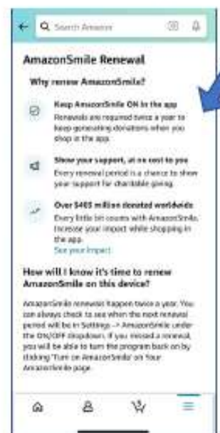
Step 6. SHOP! ☺ AmazonSmile must be renewed or re-activated on the App every 6 months. This is free, ☺