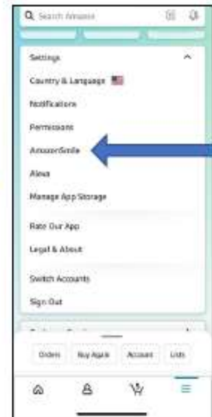
Step 3. Once in Settings, click on AmazonSmile.