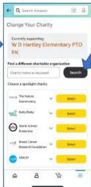
Step 4. Use the Search bar to look up W D Hartley Elementary PTO Inc as it looks here (no punctuation).