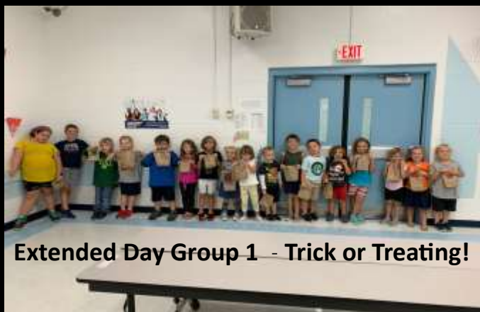
Extended Day Group 1 - Trick or Treating!