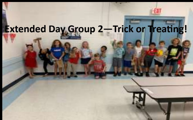
Extended Day Group 2—Trick or Treating!