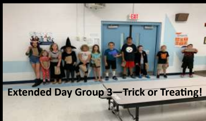
Extended Day Group 3—Trick or Treating!